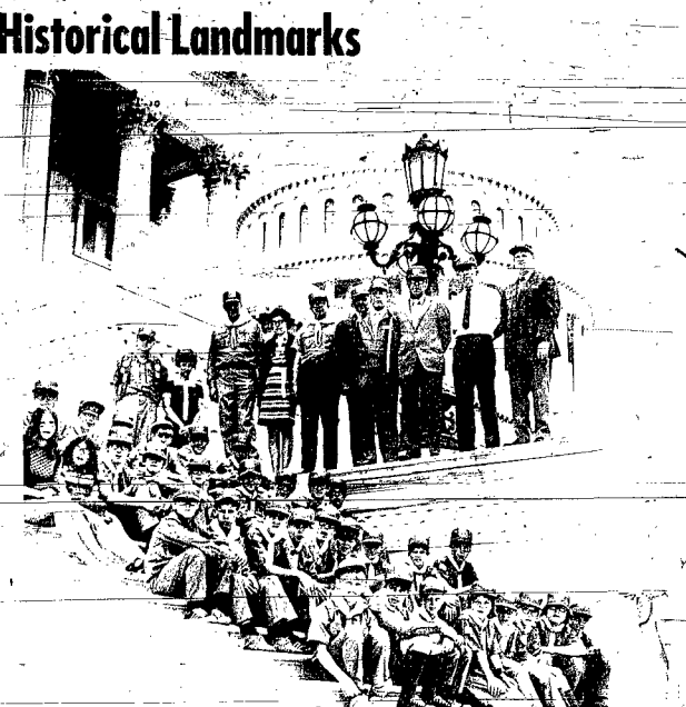
National Monument in South Dakota. Meanwhile, in Washington, D. C., the boys and their leaders and chaperones are welcomed to the nation's capital by First District Congressman Charles Thone. (See picture page in this issue of The Herald)