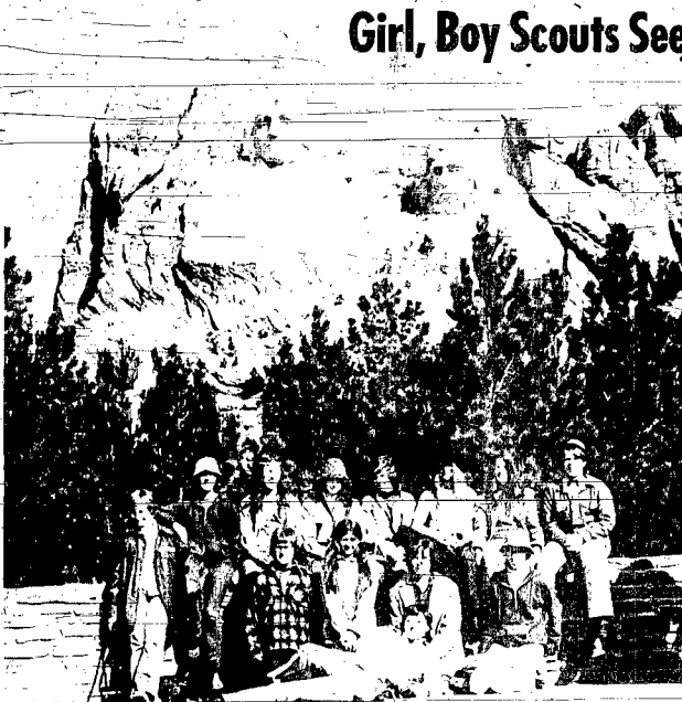
Boy Scout Troop 175 and Cadette Girl Scout Troop 145, both of Wayne, are currently on tours seeing different points of the country. At left the girls and their leaders pose for a picture below the famed carvings of presidential faces at Mt. Rushmore.

Some of the total represented additional subscriptions, but in most cases was money collected by campaign workers, from cards still out at the formal end of the campaign.