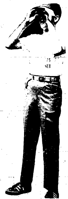
St. Prather takes a picture of the Library of Congress in the nation's capital.